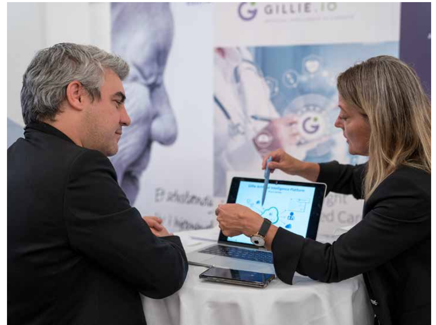
Communication is key in ensuring making sure technology moves to widespread adoption

"When a project is almost there, you need support and financing to finally reach the market. I think they should put energy and funding into the different phases, so funding becomes