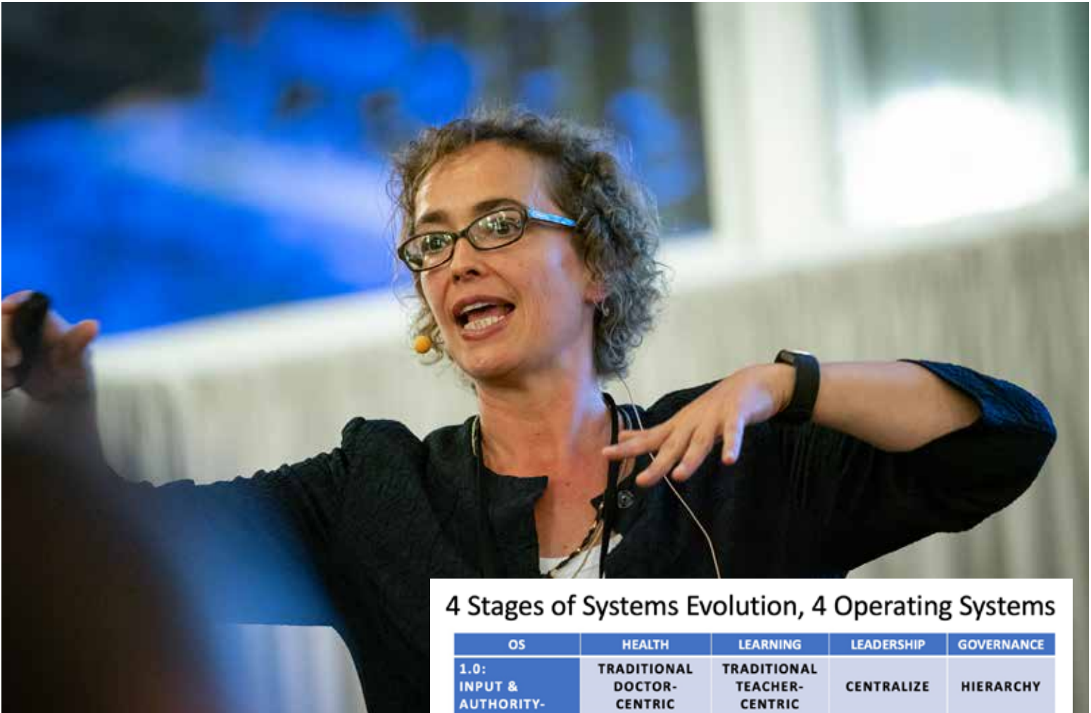
4 Stages of Systems Evolution, 4 Operating Systems