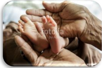
Health throughout the Life Course