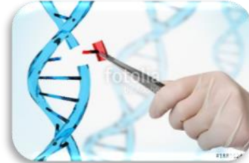
Non-communicable and Rare Diseases