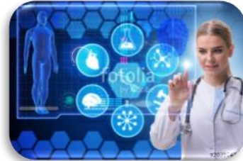
Tools, Technologies and Digital Solutions for Health and Care