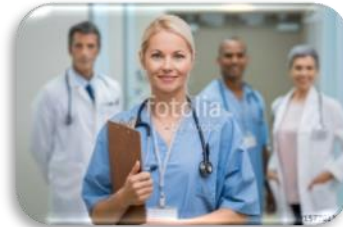
Health Care Systems