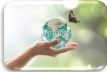
Environmental and Social Health Determinants